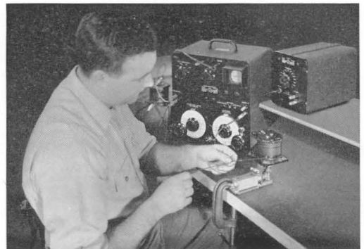
Figure 5. The Comparison Bridge used in adjusting an air-core inductor to 0.1% tolerance at General Radio's West Concord (Mass.) plant.

Grounding: Two ground positions are provided, one of which grounds the junction of the standard and unknown impedances. With this connection, the total impedances between the high terminals and ground are compared. In the other connection, the junction of the ratio arms