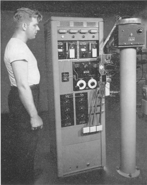
Figure 3. PROJECT TINKERTOY is the code name assigned to a program conceived and developed by the National Bureau of Standards for the Navy Bureau of Aeronautics, which involved the Modular Design of Electronics (MDE) and the Mechanized Production of Electronics (MPE).

More than 20 machines are utilized to produce electronic subassemblies automatically. Uniformity and reliability of product is achieved by employing automatic 100 percent inspection at nearly every station in the production process. This photograph shows equipment used in automatic inspection of titanate capacitors for specific capacity value. Type 722 Precision Capacitors with a range of from 110 to 1100 micromicrofarads and a Type 1604 Comparison Bridge are incorporated in the inspector. One of the precision capacitors is set at the upper tolerance limit of the required capacity, and the other is set at the lower tolerance. As the titanate bodies exit from the vibrator feeder, all silvered surfaces are checked for continuity. The capacitor is then automatically released and falls into the inspection circuit containing the precision capacitors and comparison bridge. The output of the bridge controls three inspection circuits: one to reject those capacitors that are above the upper tolerance, another to reject those bodies below the lower tolerance, and the final circuit to accept the capacitors that fall within the required tolerances. The automatic inspection of a single capacitor can be accomplished in less than half a second.