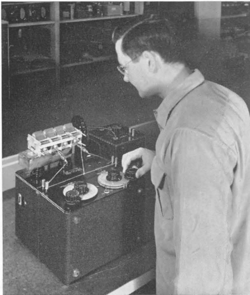
Figure 6. Another application in our own plant: testing and adjusting four-gang capacitors for proper tracking. The bridge is also used in the adjustment of ganged potentiometers.

values of impedance the voltage is decreased, corresponding to a source impedance of the order of 100 Ω.